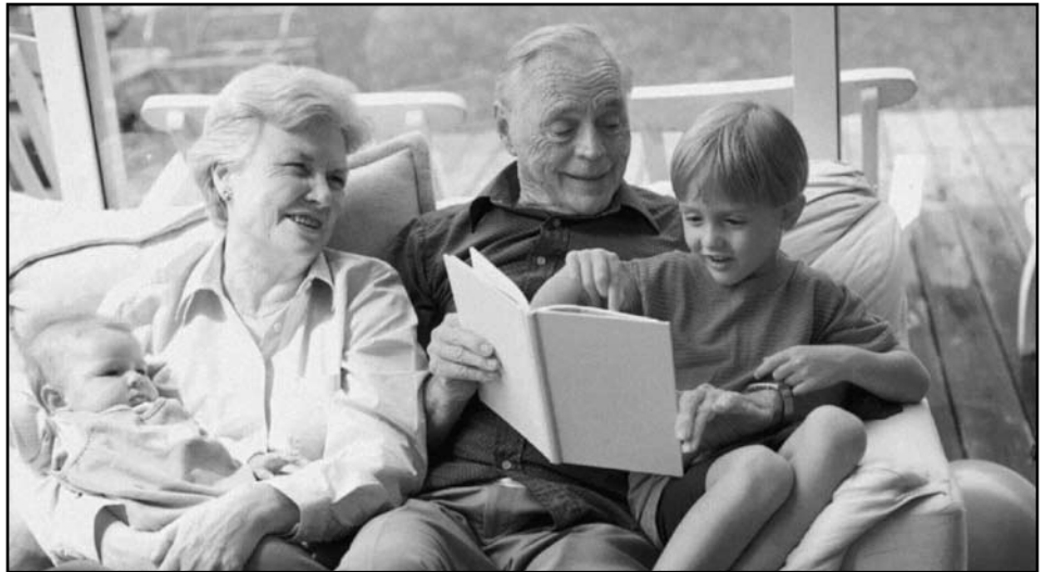
Older adults in our Foster Grandparent and Experience Corps programs volunteered nearly 75,000 hours mentoring or tutoring Portland area children. These relationships demonstrated positive improvements in student academic performance.